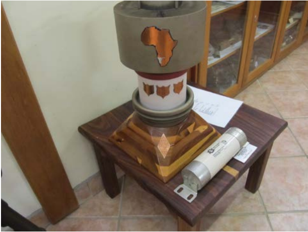
SARL Trophy from NARL