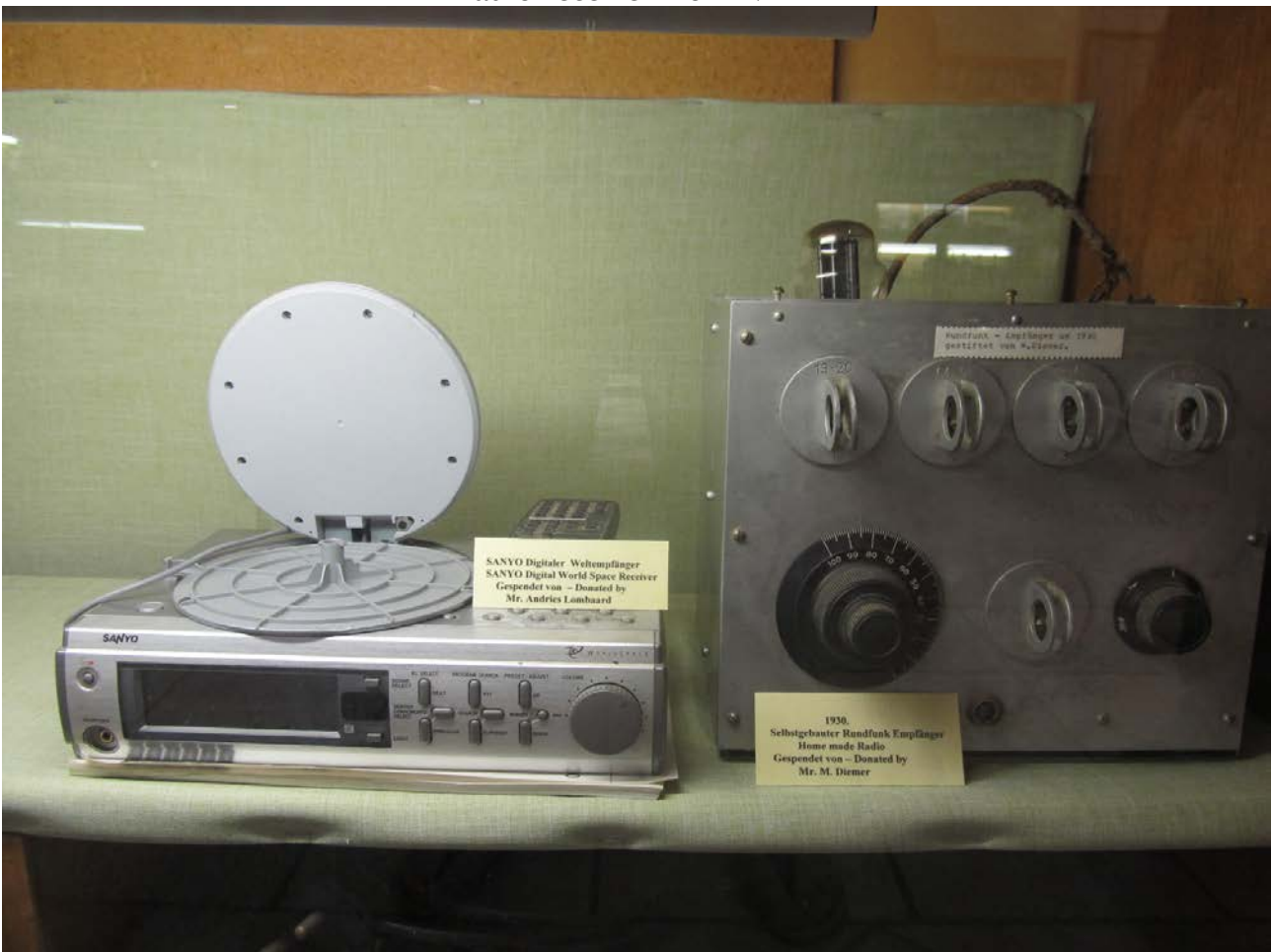
Sanyo Digital World Radio Receiver and home-made receiver