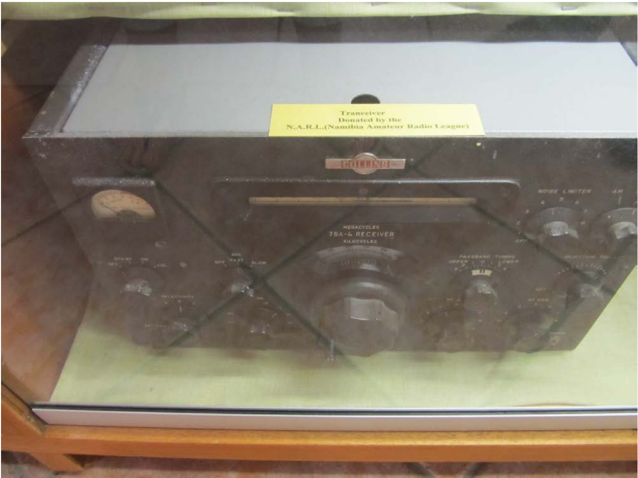
Radio receiver from NARL