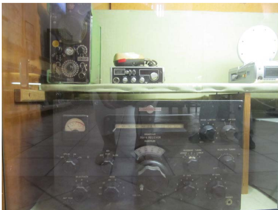
Radio equipment on display