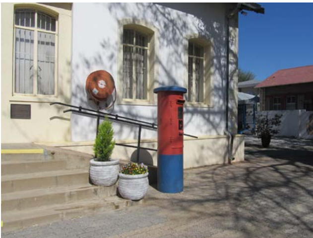
Tsumeb Museum entrance

Hopefully you will find this interesting.