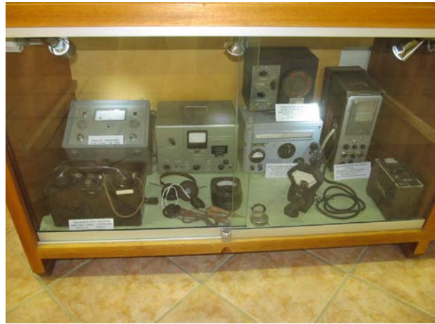
Field telephone, capacity meter & other