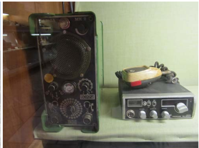
A398A and Tedalex Mobile Radios